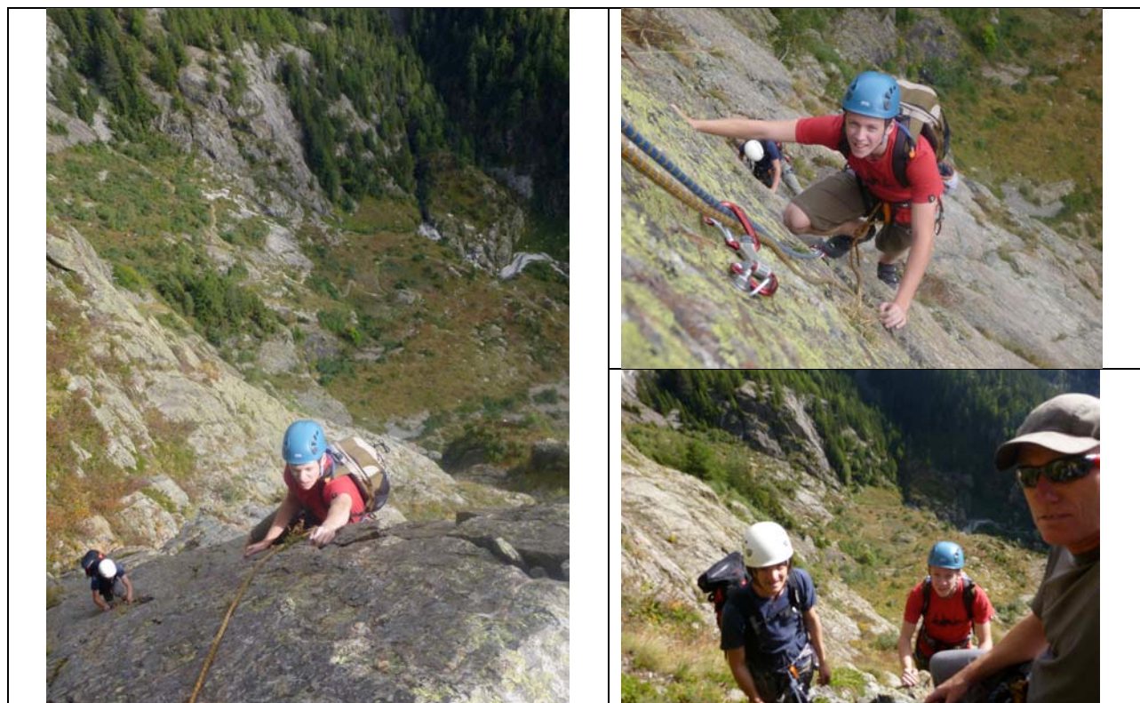
Climbing camp Dôle 5/5+ / Detailed program

Included : night in dormitories Included : night in dormitories, breakfast, lunch, dinner, technical gear (harness, climbing shoes, helmet ...), 5 days with a swiss mountain guide +3 or 4 days private guiding. Not included : transport to the start and from the end of the camp