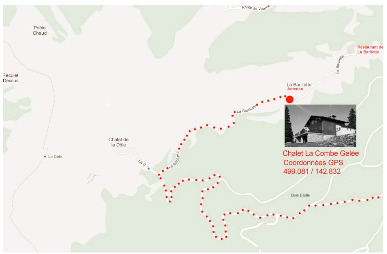
Climbing camp Dôle 6/6+ / chalet access map