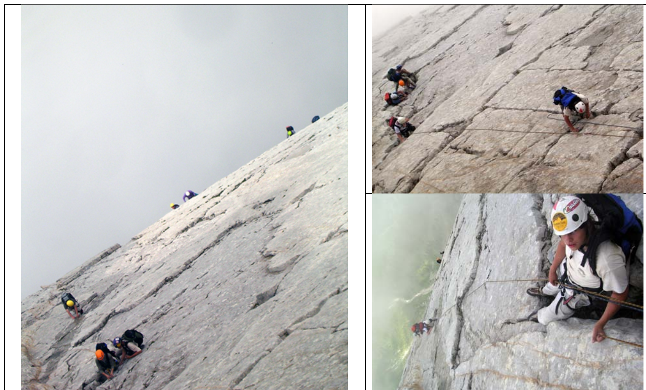
Climbing camp Dôle 6/6+ / Detailed program

Included : night in dormitories Included : night in dormitories, breakfast, lunch, dinner, technical gear (harness, climbing shoes, helmet ...), 5 days with a swiss mountain guide +5 or 6 days private guiding. Not included : transport to the start and from the end of the camp