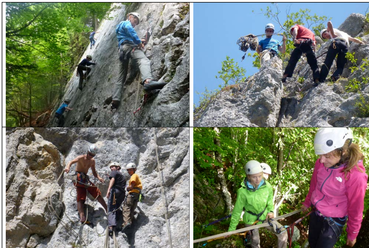
Climbing camp Dôle 3 / Detailed program

Not included : transport to the start and from the end of the camp