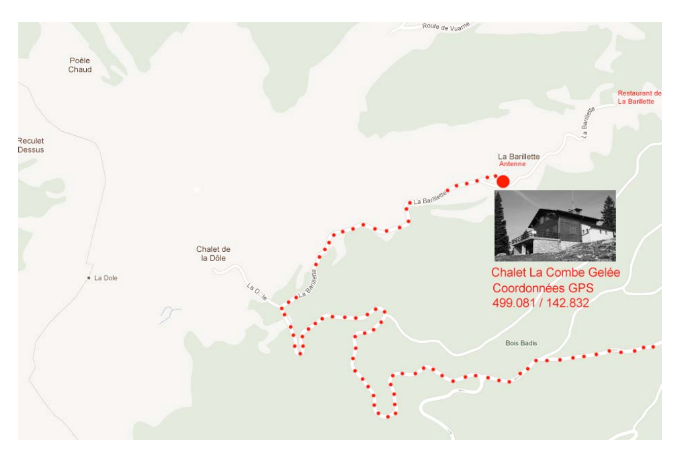
Climbing camp Dôle 1 / chalet access map