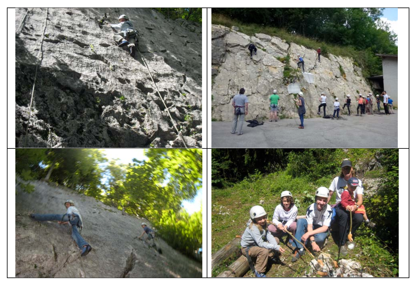
Climbing camp Dôle 1+ / Detailed program

Price Sfr. 690.- / age : 8-15 years / Dates : July 1-5 / July 8-12 / July 15-19 / July 22-26 / July 29-August 2 / August 5-9 / August 12-16 / October 14-18 / October 21-25 2024. Included : night in dormitories, breakfast, lunch, dinner, technical gear (harness, climbing shoes, helmet, carabiner ...), 5 days with a swiss mountain guide. Not included : transport to the start and from the end of the camp