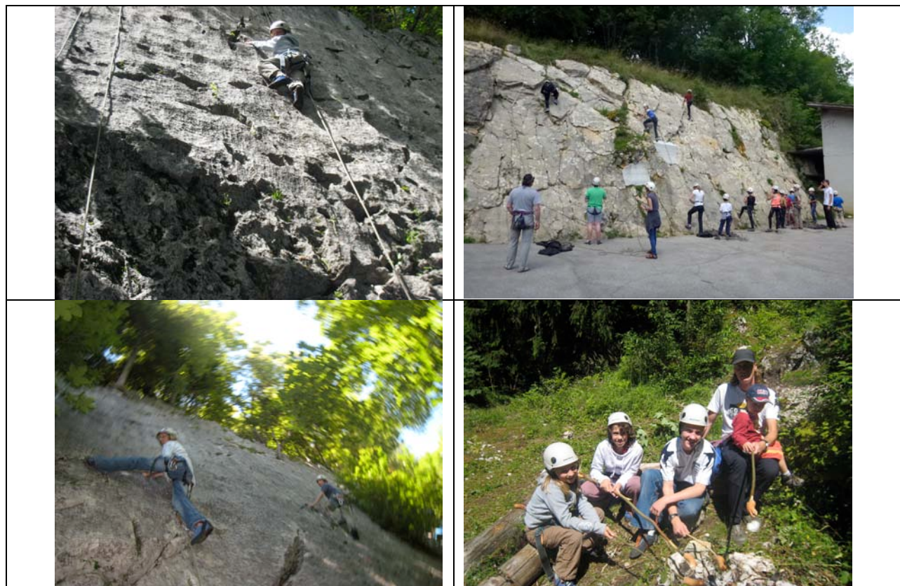
Climbing camp Dôle 1+ / Detailed program

Not included : transport to the start and from the end of the camp